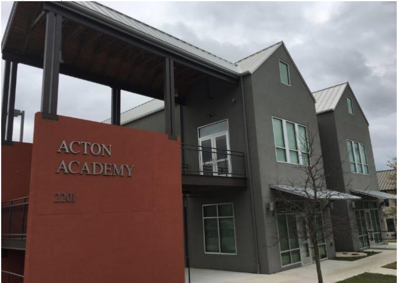
Acton Academy, Austin TX

The idea of a more personalized approach to education has gained a lot of traction in the last decade. But there's a lot of variation among those claiming "personalization." Some are teacher-driven and prescriptive. In others, students are active in charting their course.