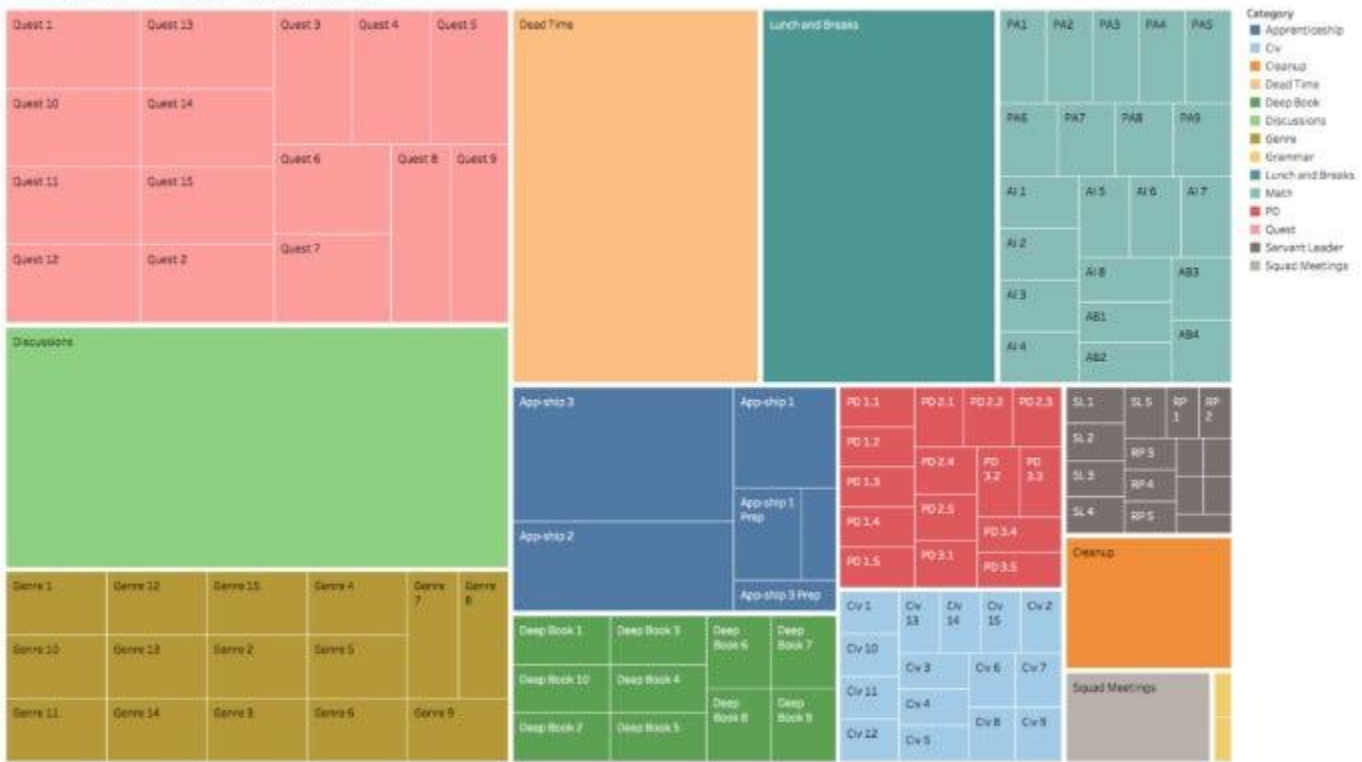
MS Traditional Plan 2018+ Time Breakdown